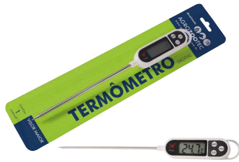
DIGITAL PROBE FOOD THERMOMETER (FROM -50 °C TO +300 °C)