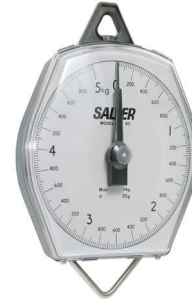
DIAL MECHANICAL METAL BODY HANGING SCALE "SALTER"