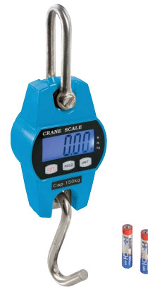
DIGITAL HANGING SCALE BACKLIGHT