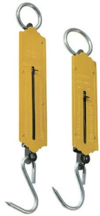
COPPER HANGING SCALE