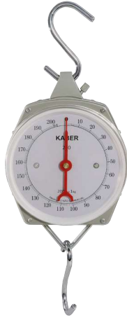
DIAL MECHANICAL METAL BODY HANGING SCALE