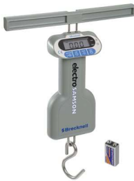
DIGITAL HANGING SCALE "ELECTROSAMOSON SALTER" 25 KG (± 0,02 KG)