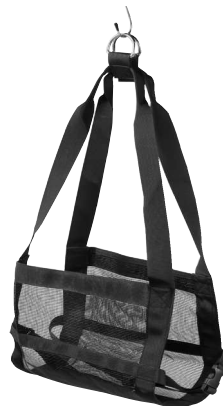
CALF WEIGHING HARNESS FOR HANGING SCALE (UP TO 80 KG)